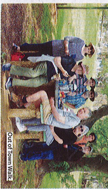
Out of Town Walk