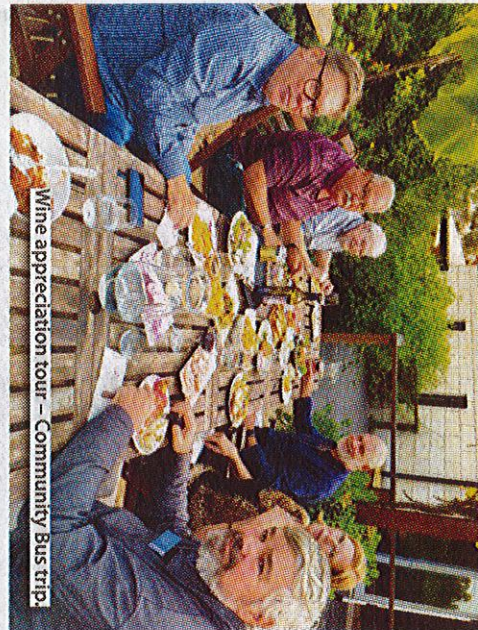
Wine appreciation tour - Community Bus trip