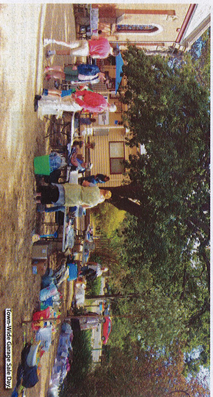
Town-Wide Garage Sale Day